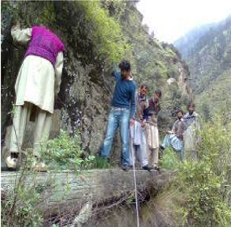
Survey of DWSS Bugna Ban Chatter, Neelum