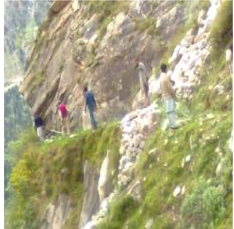
Survey of DWSS Lawat Paen UC Neelum