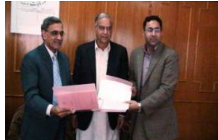
MoU Signing between AJKRSP and AJKCDP CEO AJKRSP, CDP Representative and ACS(Dev.) GoAJK