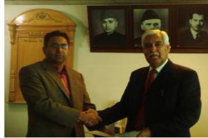
MoU signing between AJKRSP and AJK Bank CEO AJKRSP and MD/CEO AJK Bank