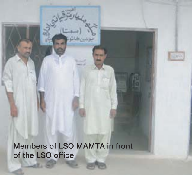
Members of LSO MAMTA in front of the LSO office

“Apart from having light at night, they can recharge their cell phones and v-phone sets now. Due to extended light hours, the children now study longer hours and women do embroidery work at night. Snake bite incidents have dramatically reduced.”