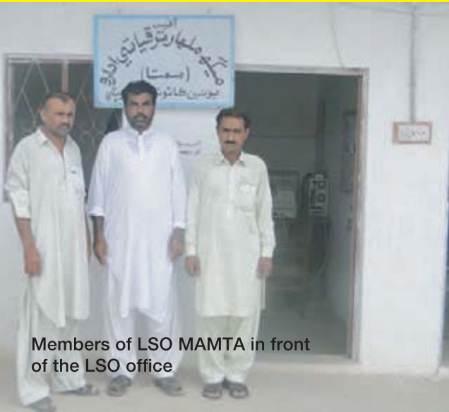
Members of LSO MAMTA in front of the LSO office

“Apart from having light at night, they can recharge their cell phones and v-phone sets now. Due to extended light hours, the children now study longer hours and women do embroidery work at night. Snake bite incidents have dramatically reduced.”