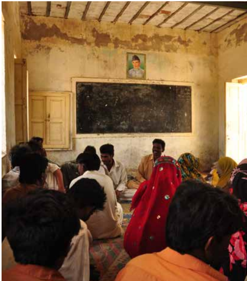
Tahafuz project is working towards building disaster management capacity of rural communities in southern Sindh