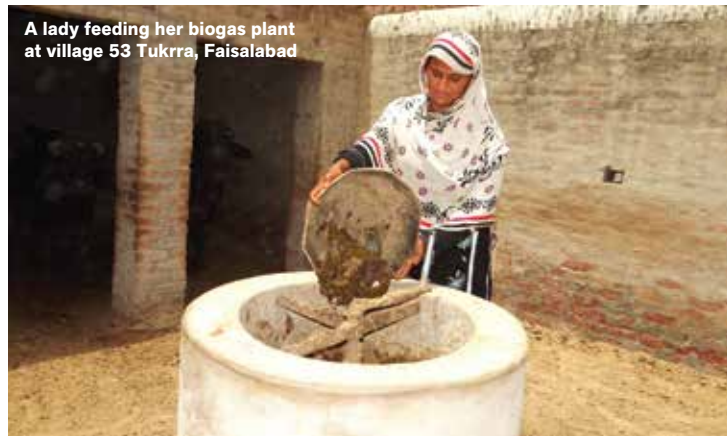
A lady feeding her biogas plant at village 53 Tukrra, Faisalabad