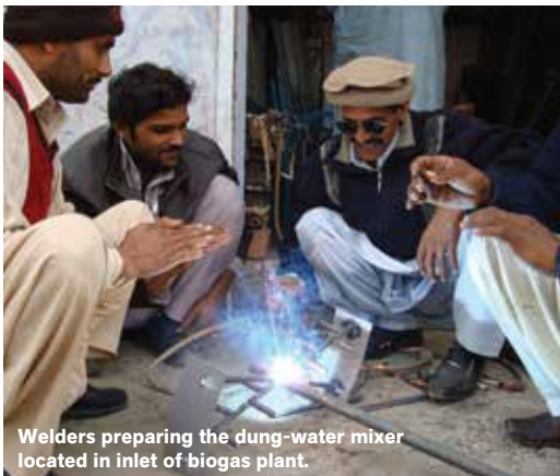
Welders preparing the dung-water mixer located in inlet of biogas plant.