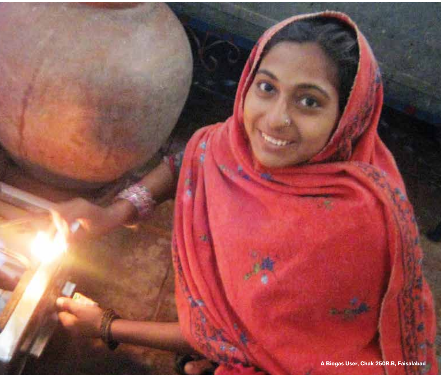
A Biogas User, Chak 250R.B, Faisalabad