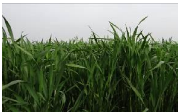
Wheat strengthened with bio slurry

Haji Irshad is using the bio slurry mixed with chemical fertilizer in ratio of 50:50. This way he is saving PKRs.600000/month. He is using biogas for running electricity generator as well. He saves PKRs.51000/month for using biogas instead of expensive diesel in the generator. Thus his monthly savings in total goes up to PKRS.651000/ month, and the profits of total cultivation is apart.