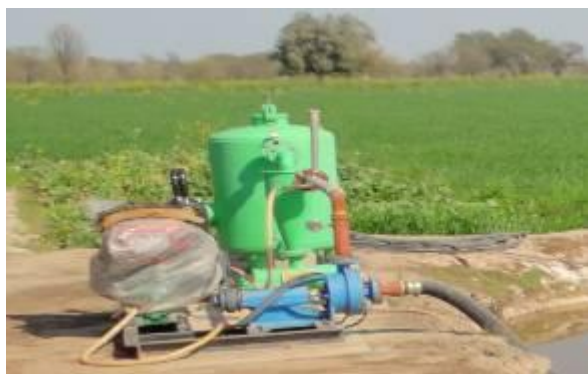
Irrigation through Drip Irrigation System (File Photo)