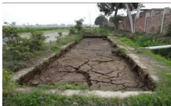
Bio Slurry channeled to agricultural Farms