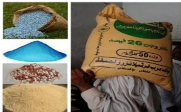
Chemical Fertilizers used to grow crops (File Photo)