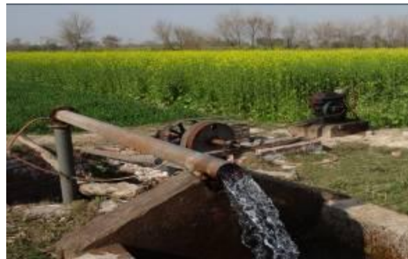
Irrigation through Diesel-Engine-Run Tube well (File Photo)

Research shows that the crops grown on chemical fertilizers may be good in height and look, but they kill the nutrition of the crops. These crops are not even good in taste and may result harm to the user as well. Apart of that the soil gets high of PH level after use of the chemical fertilizers, this eventually ends the fertility of the land and lefts it unsuitable for the next cultivation.