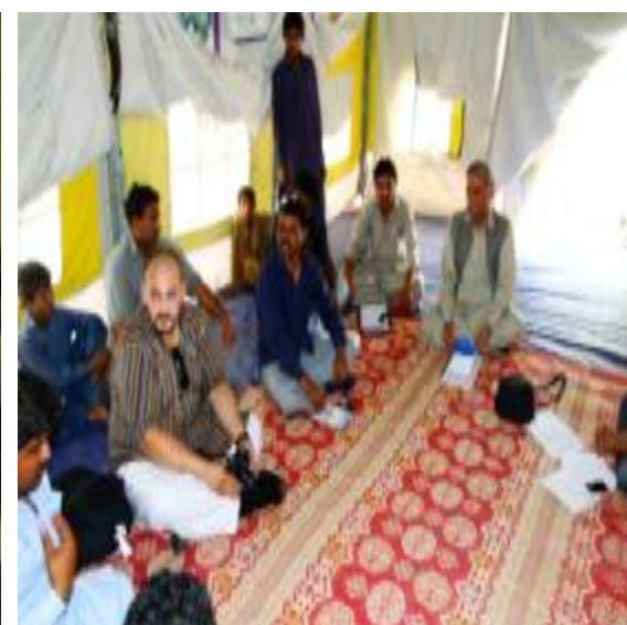
CO Visits; District: Shaheed Benazirabad Top Center: Village: Jaffer Khashkeli; Date 24 th April 2012 Left: Village: Gulbaig Chutto; Date 23 rd April 2012 Right: Village: Abdul Aziz Awan; Date 23 rd April 2012