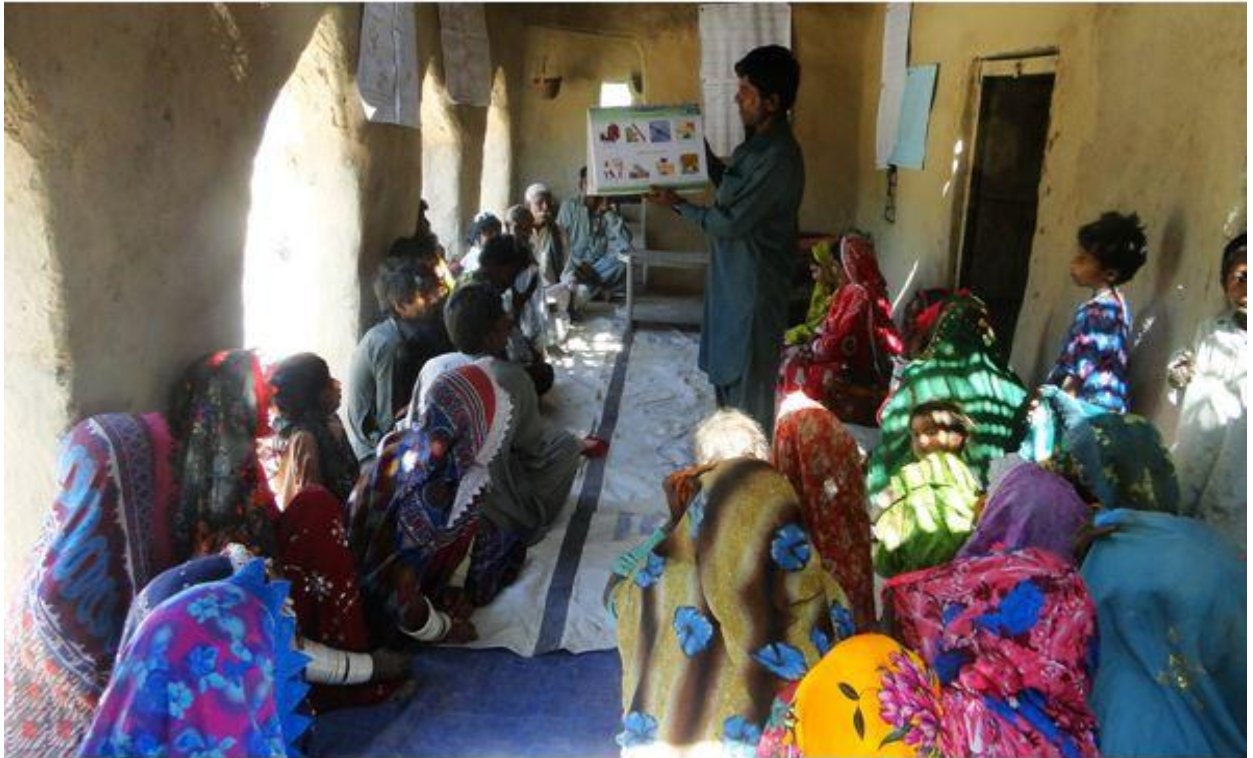
A CRP conducting an awareness session at VDMC Serki from UDMC Bustaan Tehsil Kunri District Umerkot.