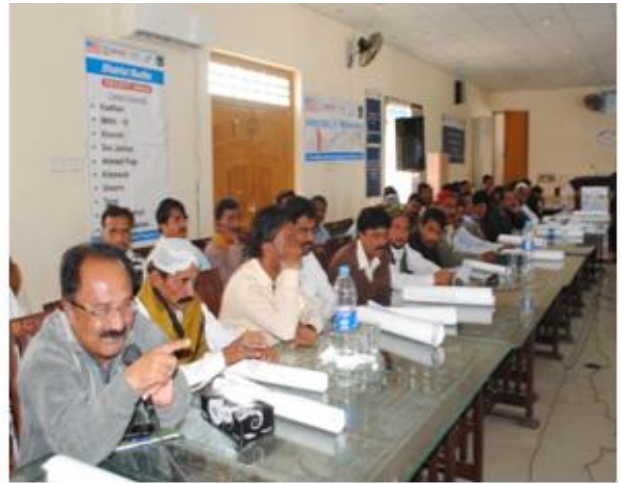
Government personnel (ADC, DO Social Welfare, Education Department and Agriculture Extension Department) and local NGO representative participated in District level Advocacy & Networking shop held at District Badin.