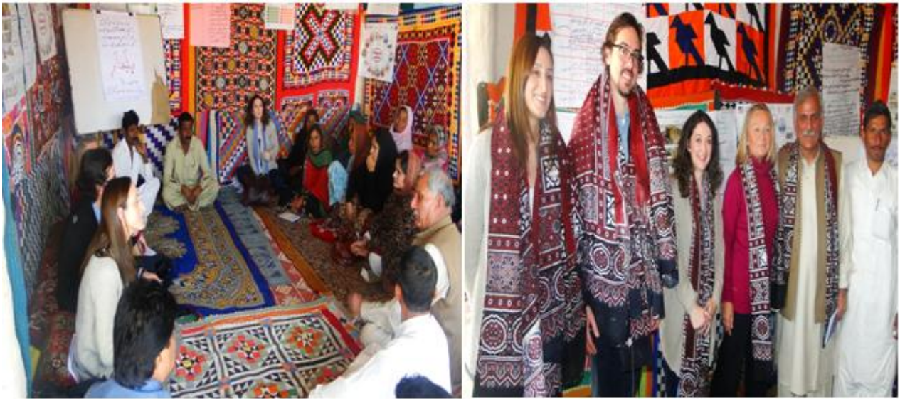
OFDA/USAID team and Project Manager Tahafuz II during visit to VDMC Kherar District Thatta.