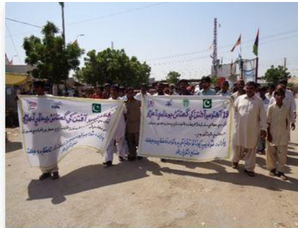
The community member and RSPs officials are involved in celebrating international day for disaster risk reduction on 13th October 2014 at District Umerkot and District Tharparkar