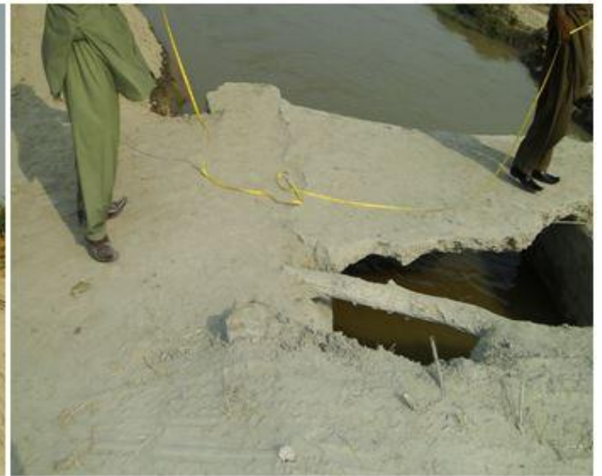
VMDC Bhurigri from UDMC Araro Bhurigri identified rehabilitation of earthen road along with improvement of RCC culvert.