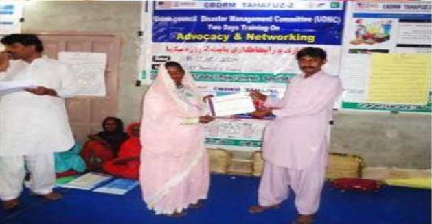
Two days training on advocacy and networking for new UDMC members at DIU Samoro District Umerkot.