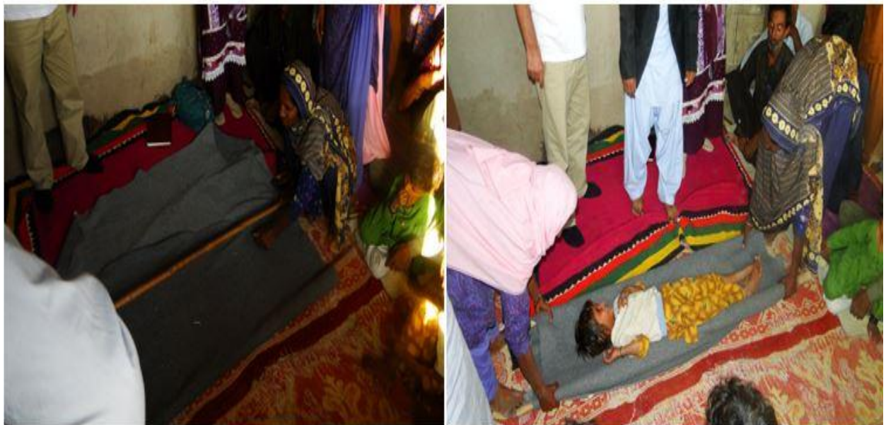
Participants exercising practices in an awareness session at settlement Jan Muhammad Lashari of VDMC Serhi from UDMC Bhitaro District Tharparkar