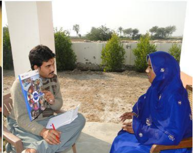
Knowledge retention assessment conducted by monitoring Officer RSPN during visit at VDMC Kharar from UDMC Keenjhar (Thatta) and VDMC Mahdum Pur UDMC Khorwah (Badin).