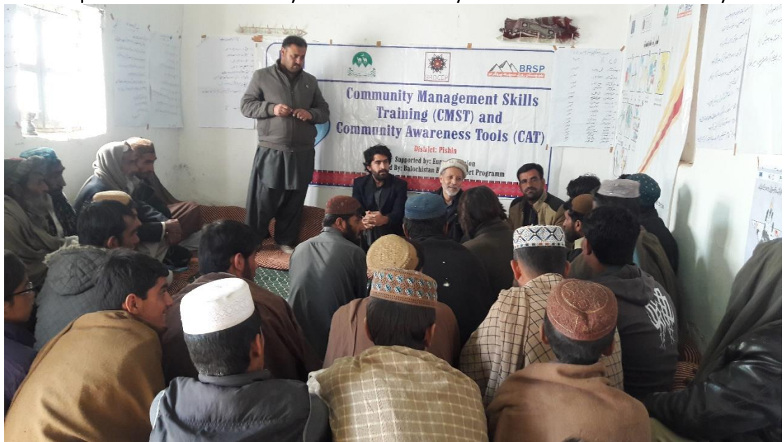
Picture: CMST at UC Gharshanani, Field Unit Khanozai, District Pishin