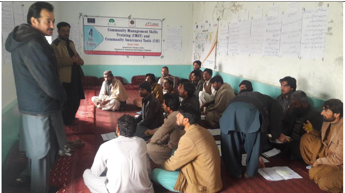
Picture: CMST at UC Margha Zakarazai, Field Unit Khanozai, District Pishin

3. Increase in learning of the participants: The group work presented by the participants at both events were speaking themselves the learning level of the participants, which was very high. Then I asked questions about what they had learnt so far, and found that all participants have several points of their interest as their learning. Majority participants mentioned the exclusion exercise, the qualities of good community leader, the fact that they themselves are responsible for changing the destiny and fate through collective efforts. And basically these were the topics they had covered so far.