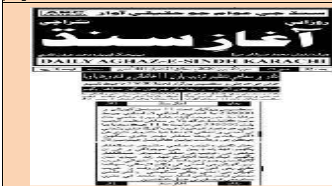
April 20, 2020, Dadu-Johi: print media reports on distribution of income generation grant to poor households by TRDP under SUCCESS program.