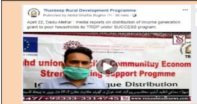
April 22, 2020, Dadu-Mehar: media reports on distribution of income generation grant to poor households by TRDP under SUCCESS program.